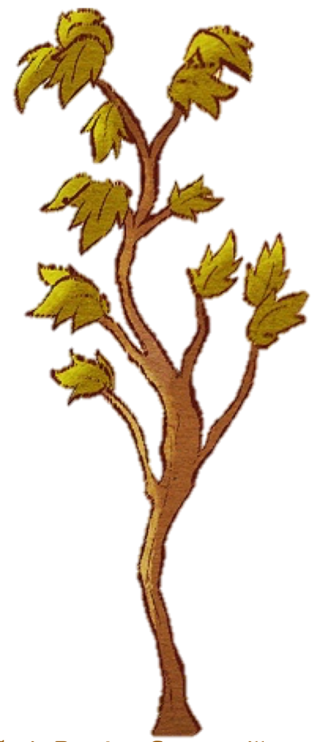
Tania Ramírez Cuevas - illustrator